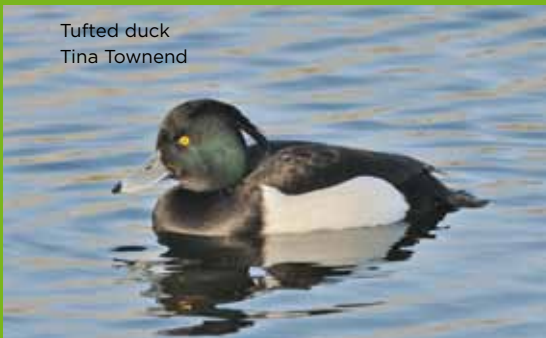
Tufted duck Tina Townend