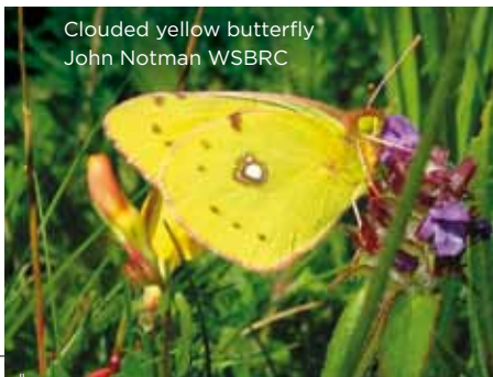
Clouded yellow butterfly