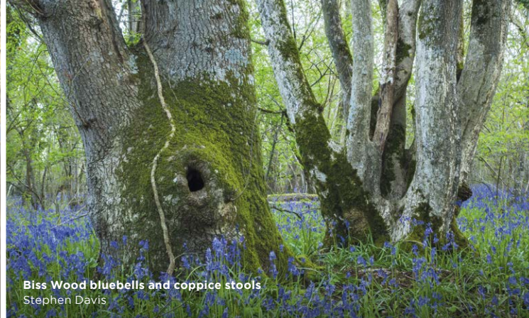
Biss Wood bluebells and coppice stools