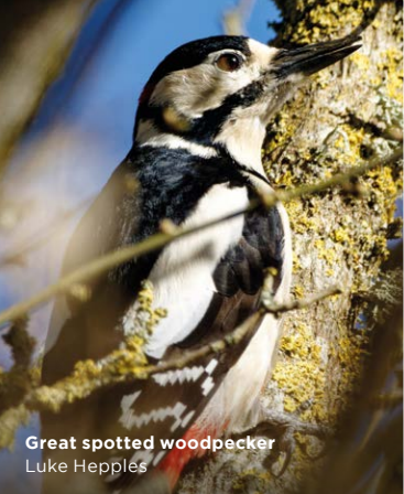
Great spotted woodpecker Luke Hepples